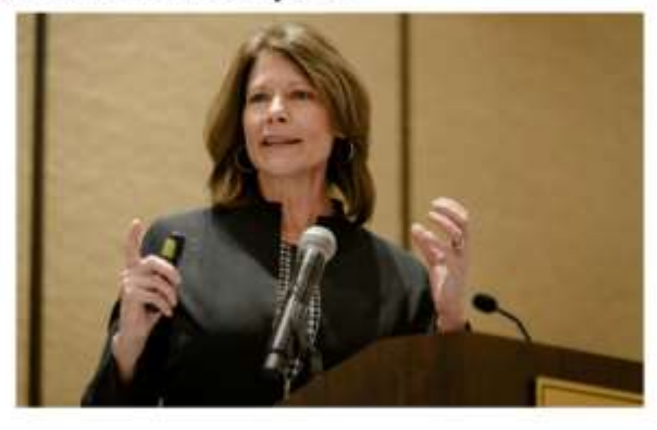
Congresswoman Cheri Bustos